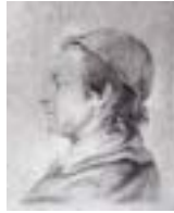
Phillip Matthäus Hahn