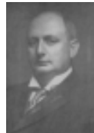
William Edwin Sessions