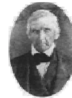
Eli Terry Sr.