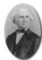
Jean Eugène Robert-Houdin