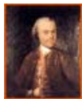
Pierre Jaquet Droz