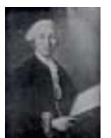
Jean André Lepaute